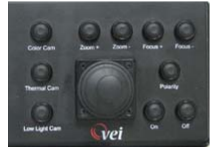
Outdoor Waterproof Controller